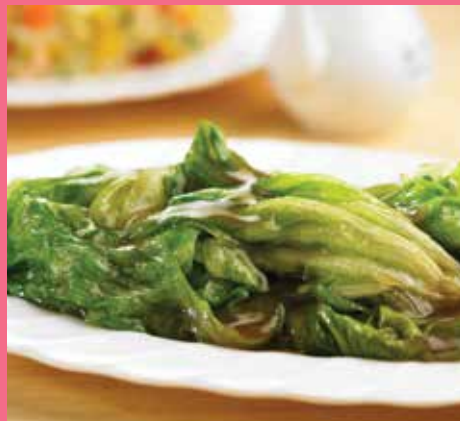
蚝油西生菜 Lettuce with Oyster Sauce