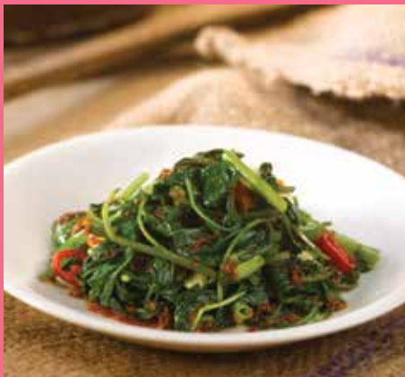
叁巴辣蕹菜 Sambal Kang Kong