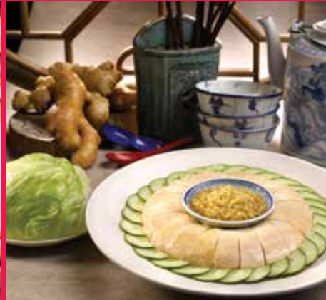
三水姜茸鸡 Samsui Ginger Chicken +$6