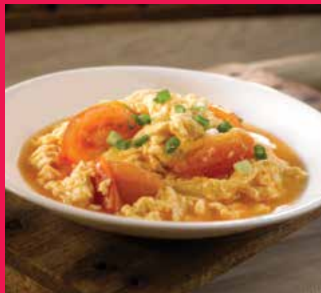
番茄蛋 Tomato Egg