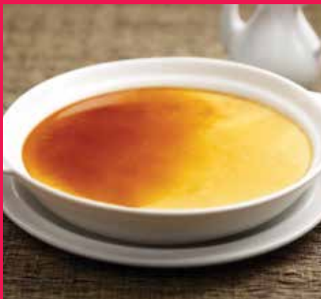
蒸水蛋 Steamed Egg