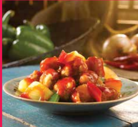
旺来咕嚕肉 Sweet & Sour Pork