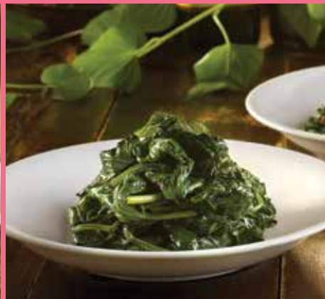
阿婆/阿公番薯叶 Ah Por/Ah Kon Fan Shu Leaves +$2