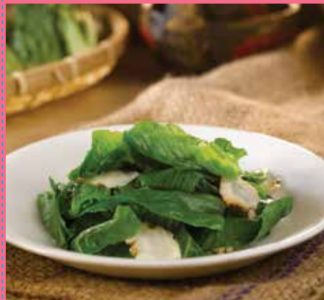
当归芥兰仔 Baby Kailan with Tong Kwai