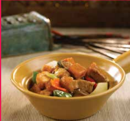
鸡胸烧肉煲 Stewed Chicken Breast w Roast Pork