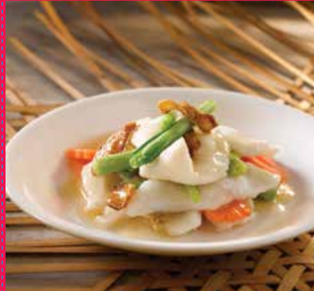
清蒸/姜葱生鱼片 Steamed/Spring Onion Fish Slices +$3